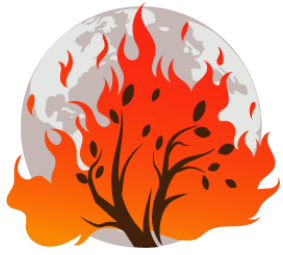
The Burning Bush Ex 3:1-12